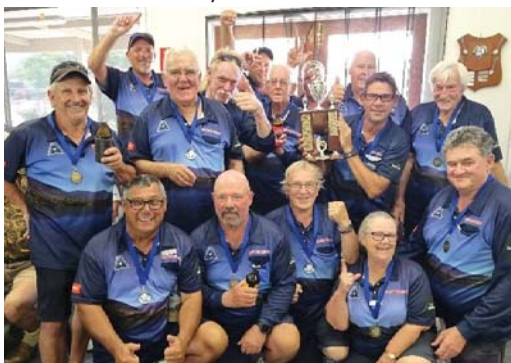
GV Weekend Division Five Premiers - Eildon -