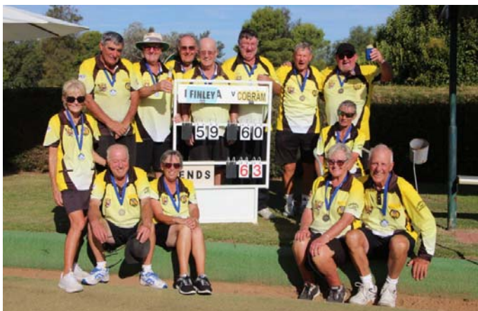
Murray Weekend Division Two Premiers - Cobram –