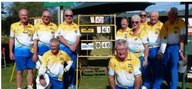
Murray Weekend Division Four Premiers - Numurkah -