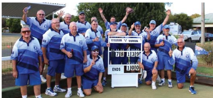
GV Weekend Division Two Premiers - Euroa –