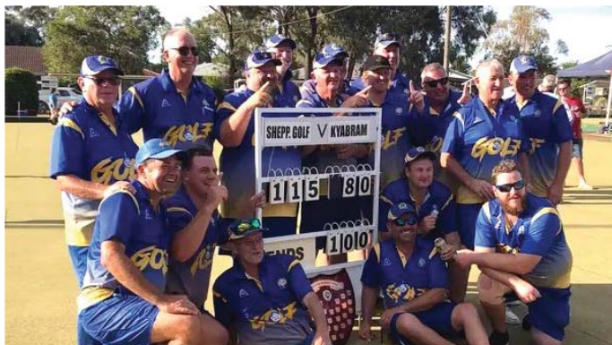
GV Weekend Alan Matheson Shield Division One Premiers - Shepparton Golf –