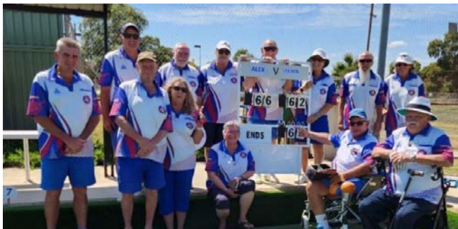
GV Midweek Division Four Premiers - Alexandra –