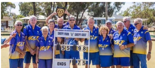
GV Midweek Division Two Premiers - Shepparton Golf –