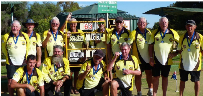
Murray Weekend Division One Premiers - Cobram –