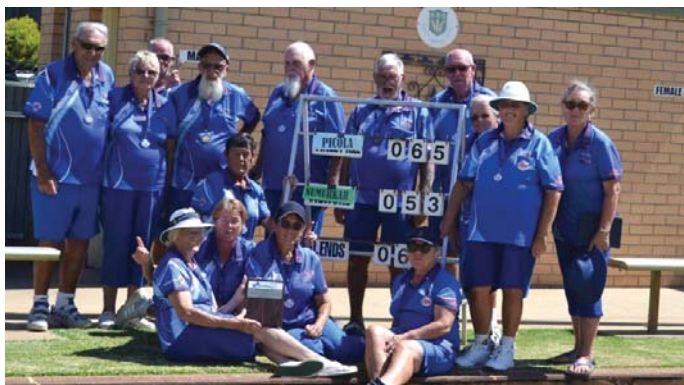
Murray Midweek Division Two Premiers - Picola –