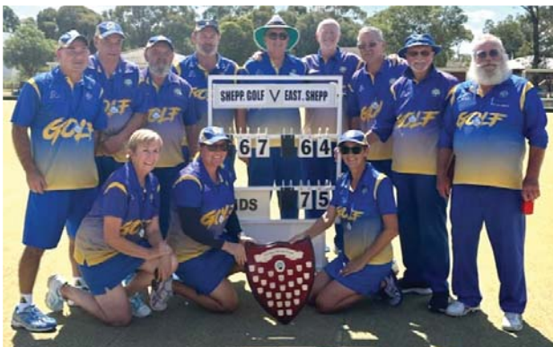
GV Midweek Edna Harling Shield Division One Premiers - Shepparton Golf –