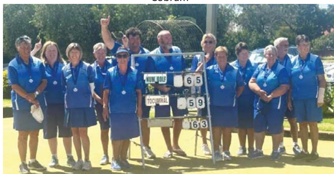
Murray Midweek Division One Premiers - Numurkah Golf -