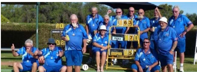
Murray Weekend Division Three Premiers - Picola –