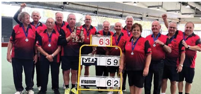
GV Weekend Division Six Premiers - Kyabram –