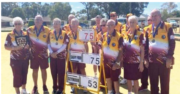
GV Midweek Division Three Premiers - Shepparton Park –