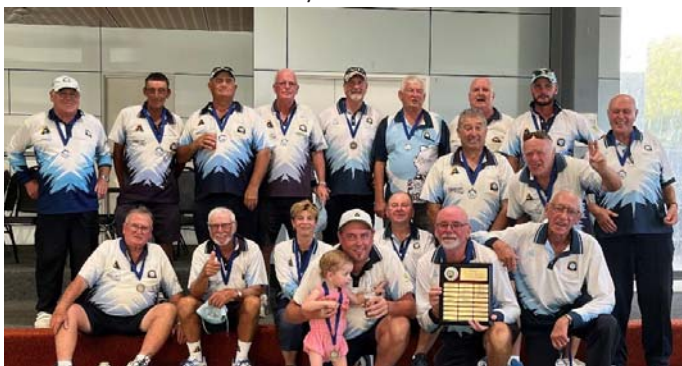
GV Weekend Division Four Premiers - Seymour VRI -