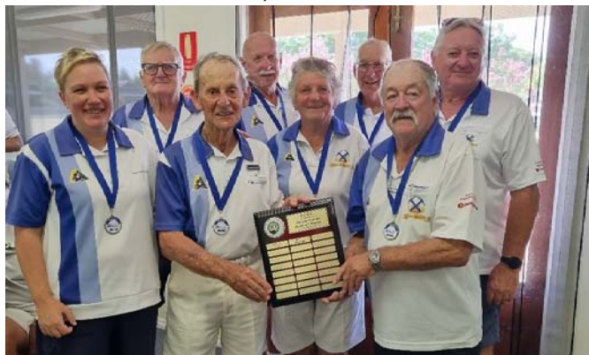
GV Weekend Division Seven Premiers - Rushworth –